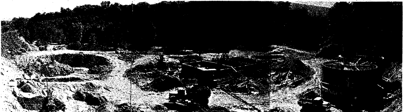
Early stages of construction at the Augusta Treatment Plant showing — Control Building Foundation, center, and sludge digesters, right.